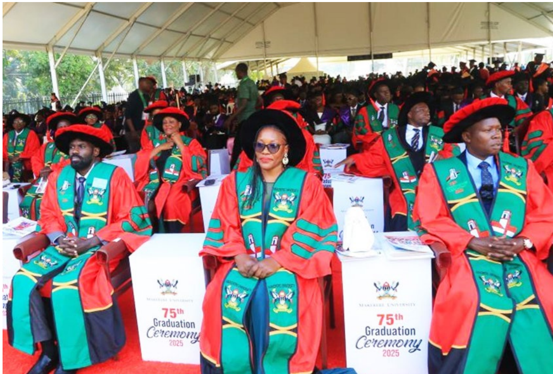
Some of the PhD Graduands from CoCIS during the 75 th Graduation