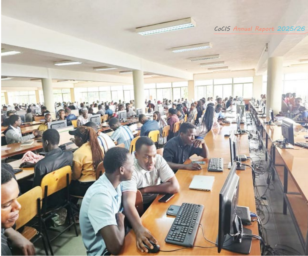
First Year Students of SCIT E-Learning Training on 13 th August 2025 in Lab 4 Block B