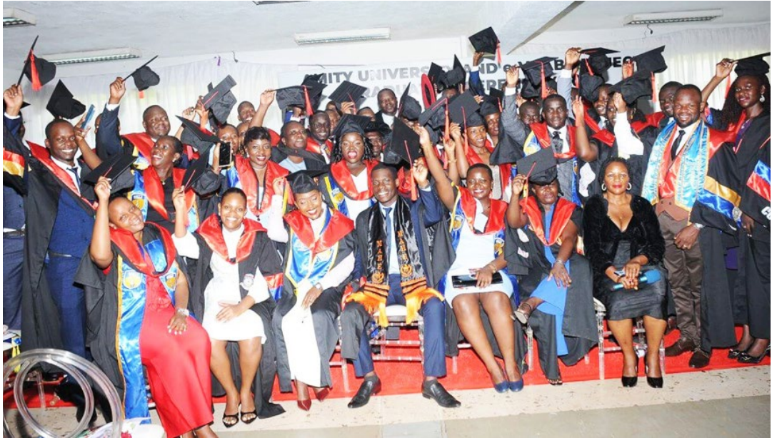
Graduands and the college management team in a group photo