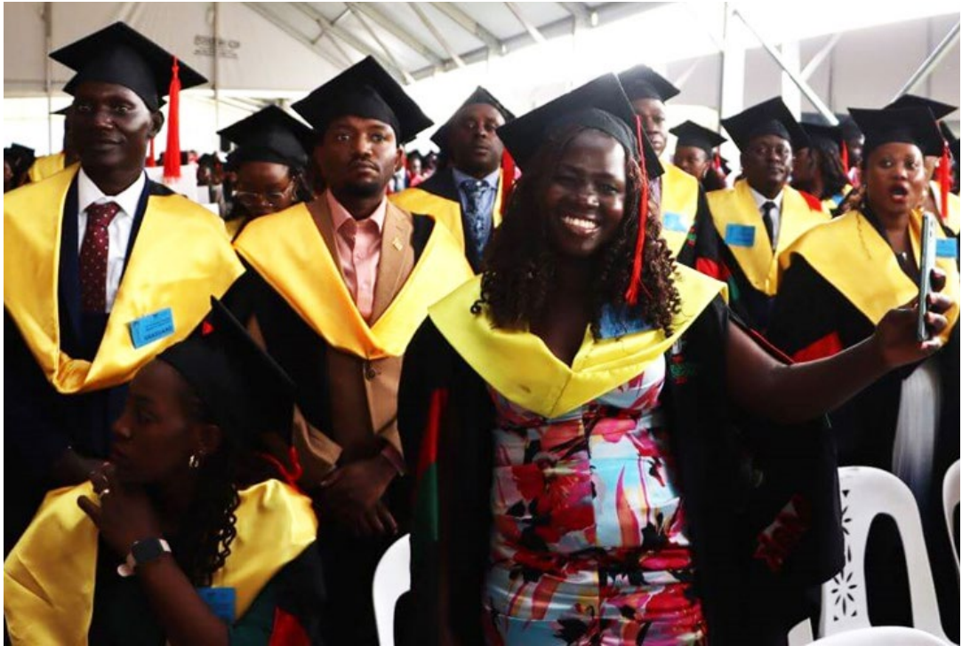
CoCIS master graduands in the freedom square stand as their names are read during the 75 th Graduation

The college presented a total of 681 graduands at the 75 th Graduation ceremony, presided over by Dr. Crispus Kiyonga, the Chancellor. The breakdown of graduands is as follows: