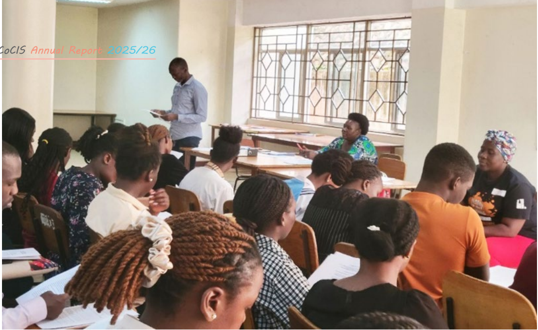
The Field Attachment Coordinator at EASLIS Welcoming staff and students at the Orientation Workshop