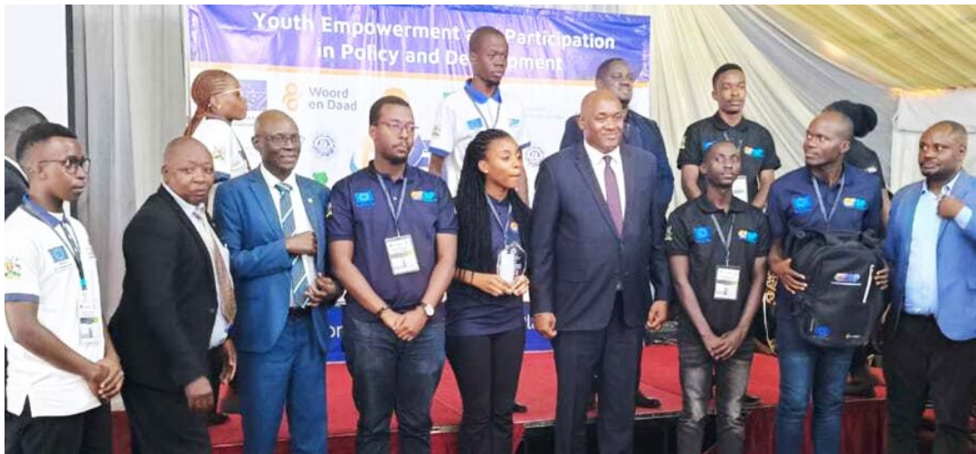
Students with other competitors pose for a group-photo with the Minister for ICT and National Guidance Dr. Chris Baryomunsi (6 th ) after the award ceremony.