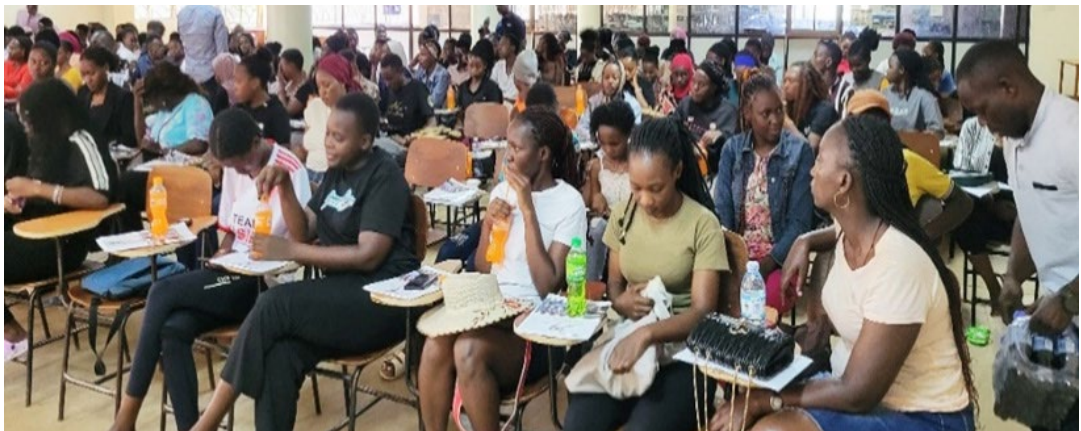
EASLIS Students at the Workshop

In 2025, the internship program at the School of Computing and Informatics Technology (SCIT) demonstrated continued growth and improvement, with a total of 407 interns participating across various departments. The overall performance remained strong, with a mean score of 80.35%, reflecting effective supervision and well-structured placement environments. Remarkably, SCIT interns achieved higher average scores compared to previous years, indicating enhanced training and mentorship quality. The majority of placements were within regional organizations, with a few international internships that showcased the program's expanding global partnerships. with high-performing organizations to sustain and further improve internship outcomes in future cohorts.