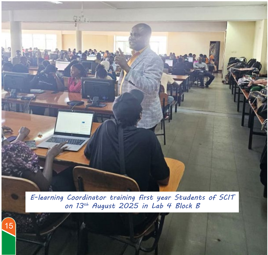
E-learning Coordinator training first year Students of SCIT on 13 th August 2025 in Lab 4 Block B

Throughout the year, we have witnessed increased student engagement and improved teaching effectiveness due to the support provided by the college's e-learning team.